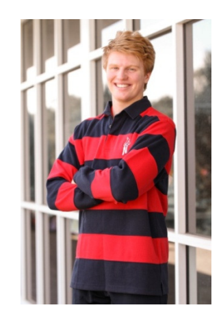
3. Rugby Top