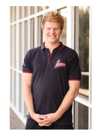
6. Polo (Cotton)