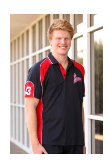
11. Carnival shirt