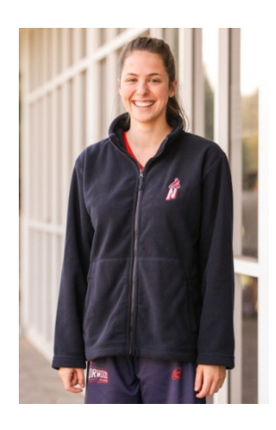
2. Full Zip Polar Fleece