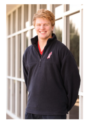
10. Half zip Polar Fleece